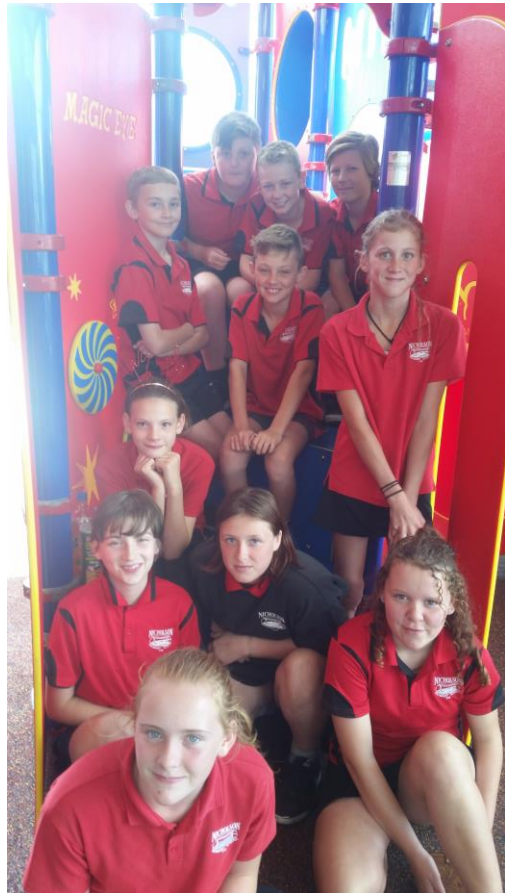
Grade 6 out and about enjoying their shopping and having lunch together